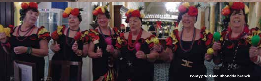
Pontypridd and Rhondda branch