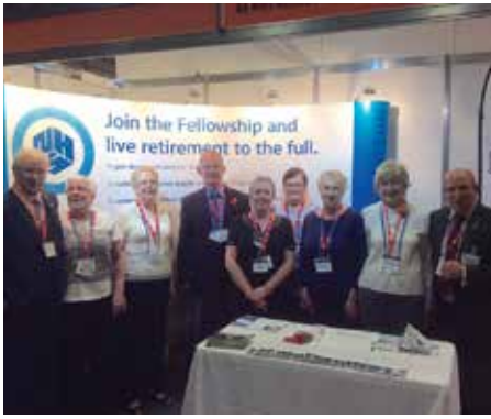
NHSRF officers and members promoting the Fellowship at the NHS Providers Conference in Birmingham November 2015