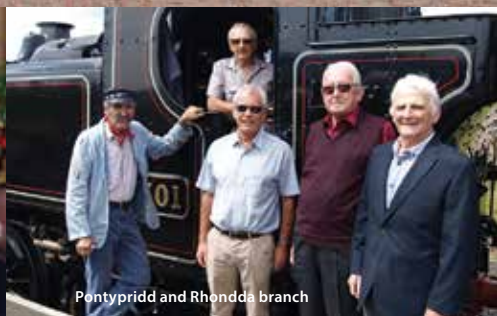
Pontypridd and Rhondda branch

Railway taking a journey from Kidderminster to Bridgenorth. After a leisurly journey through beautiful countryside we had an excellent lunch at the Punchbowl Inn in Bridgenorth.