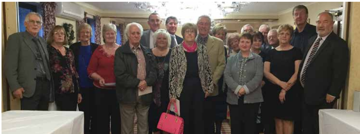
SE Wales Amulance branch Christmas dinner party