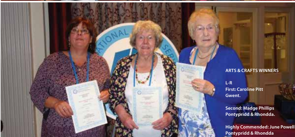
ARTS & CRAFTS WINNERS