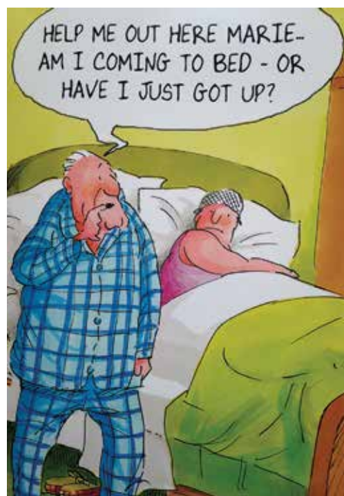
From my loving grandchildren on the occasion of my 70th. birthday – Editor