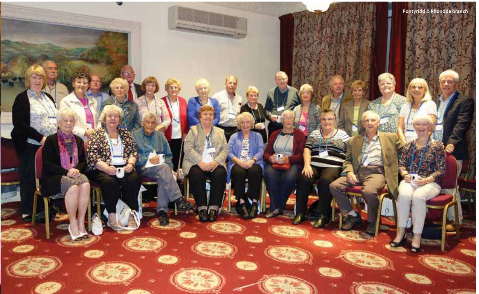
Pontyridd & Rhondda branch