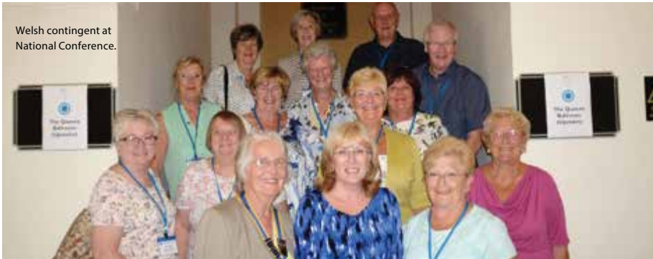
Welsh contingent at National Conference.