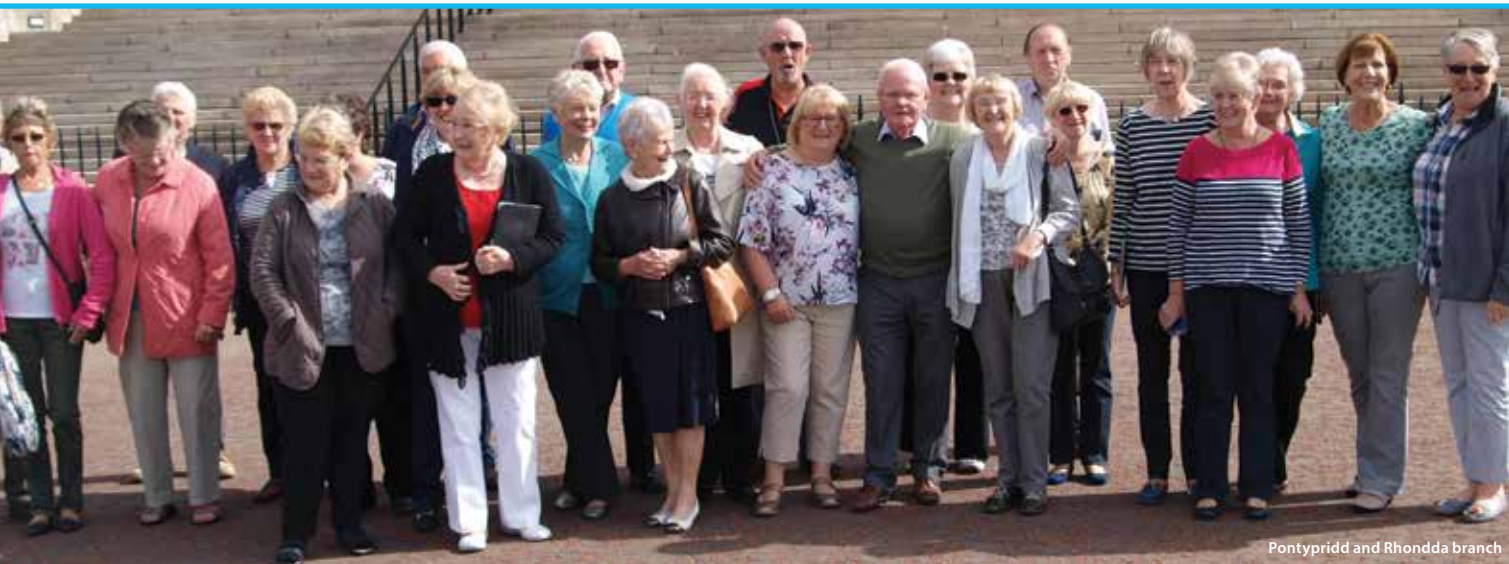
Pontypridd and Rhondda branch